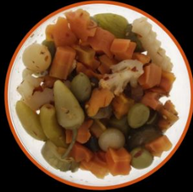
Mixed Pickles مخللات مشكلة $ 2.99

Crunchy, tangy vegetables like cucumbers, carrots, and cauliflower, marinated in a flavorful brine.