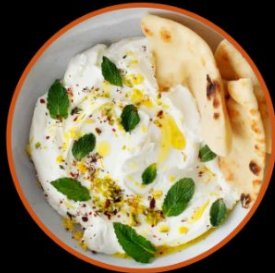
Labneh Plate لبنة $ 4.99

An assortment of savory, marinated olives with a blend of herbs and spices.