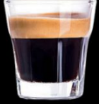
Espresso Shot اسبريسو $ 1.59