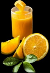
Orange Juice عصير البرتقال $ 4.99