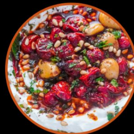
Labneh W Shatta لبنة و شطة $ 5.99

Creamy labneh topped with a spicy, tangy chili paste for an extra kick.