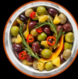
Mixed Olives زيتون مشكل $ 2.99

Crunchy, tangy vegetables like cucumbers, carrots, and cauliflower, marinated in a flavorful brine.