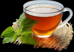
Tea W Mint شاي بننع $ 2.99