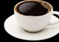
Drip Coffee قهوة مقطرة $ 2.99