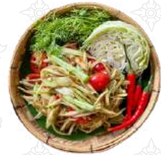
THUM MAK HOONG the original papaya salad with fermented fish sauce and crab paste