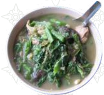
OW LAM pork or waterbuffalo stew with a "sakhan" peper vine