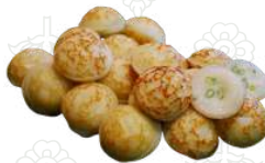
KANOM KHOK fried coconut pancakes