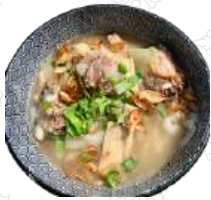
KHAO PIAK SEN thick chicken rice noddle soup