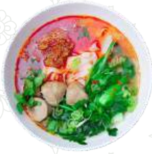
KHAO SOI pork/tomato broth soup with fermented bean paste