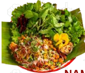
NAM KHAO fried coconut curry sticky rice salad with fermented sour pork