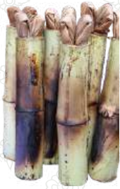
KHAO LAM coconut sticky rice in bamboo